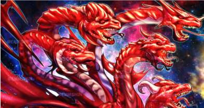
THIS IS SATAN!