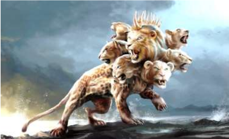
THIS IS IMPERIAL ROME!