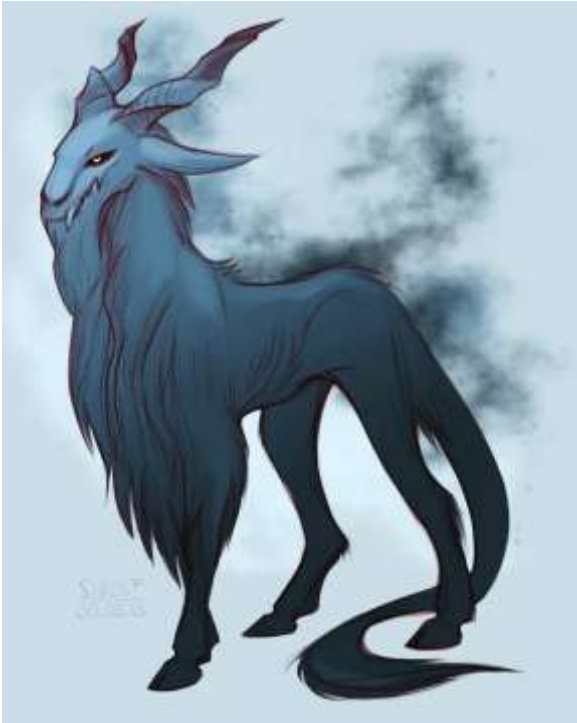
THIS IS STATE RELIGION!